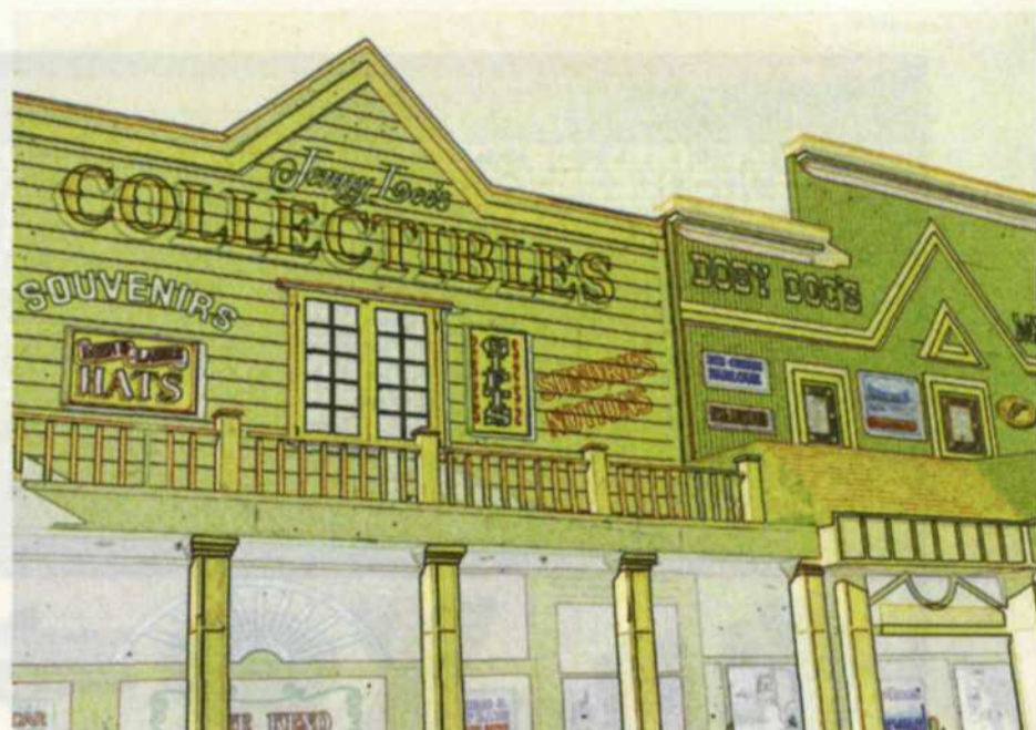
Here's a stock color negative image of a western town (left), and the new version (right), created with the filter>stylize>find edges pulldown menu.